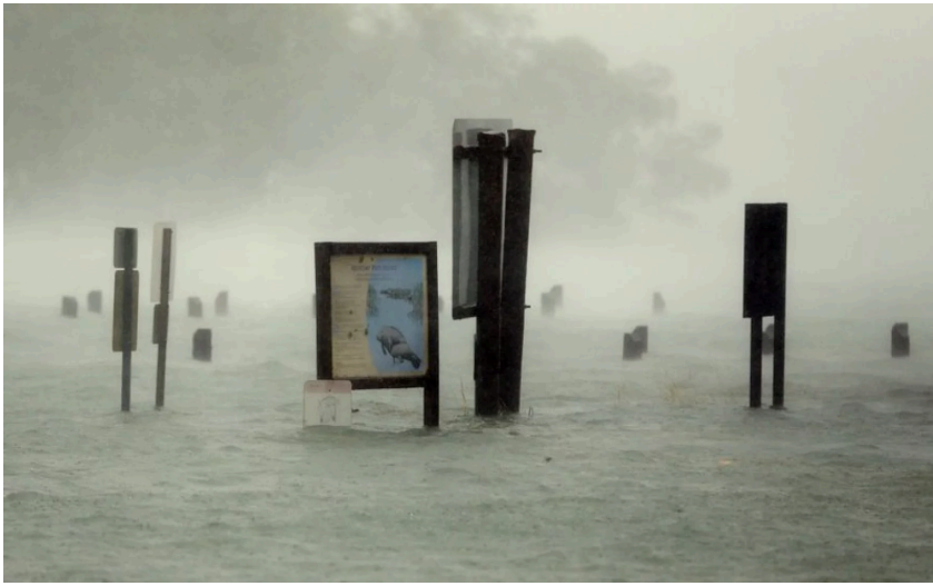
Flood waters rise around signs at the Haulover Marine Center at Haulover Park as Hurricane Irma passes by, Sunday, Sept. 10, 2017, in North Miami Beach, Fla.