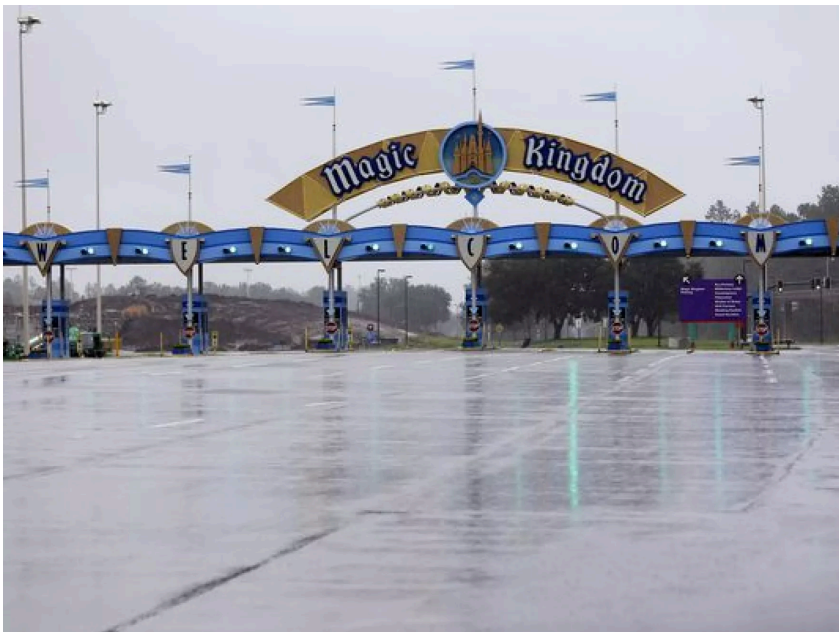
The entrance to the Magic Kingdom at Disney World is empty as the theme park was closed because of Hurricane Irma approaching the central Florida area, Sept. 10, 2017, in Lake Buena Vista, Fla. Other tourists attractions including Universal Studios and Sea World were also closed and planned to reopen Tuesday.