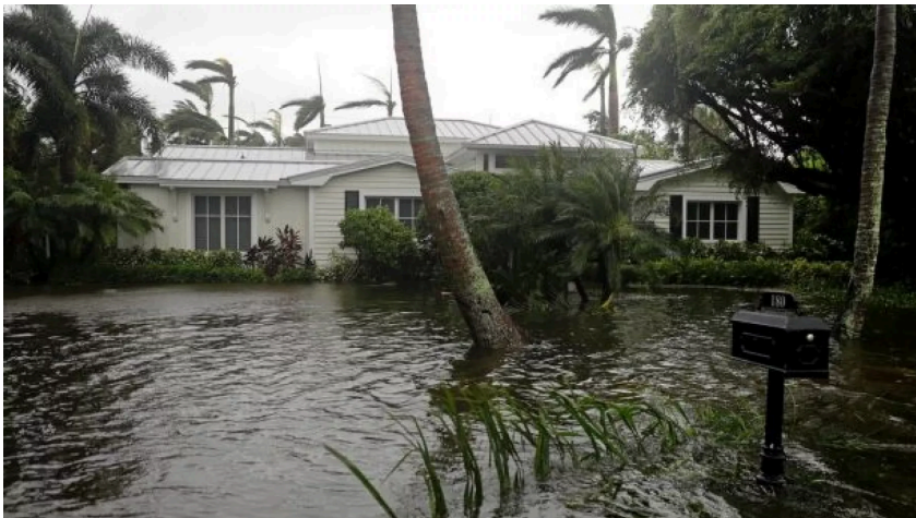
A house surrounded by water as Hurricane Irma roared through Naples, Fla., on Sunday.

Next on Irma's path of destruction were places such as Naples, Fort Myers, Cape Coral and Estero, before making its second landfall on Marco Island. With maximum sustained winds of 105 mph, serious damage ensued.