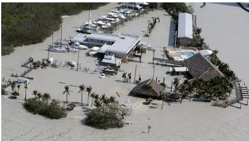
Floodwaters surround Gilbert's Resort in the aftermath of Hurricane Irma, Monday, Sept. 11, 2017, in Key Largo, Fla.