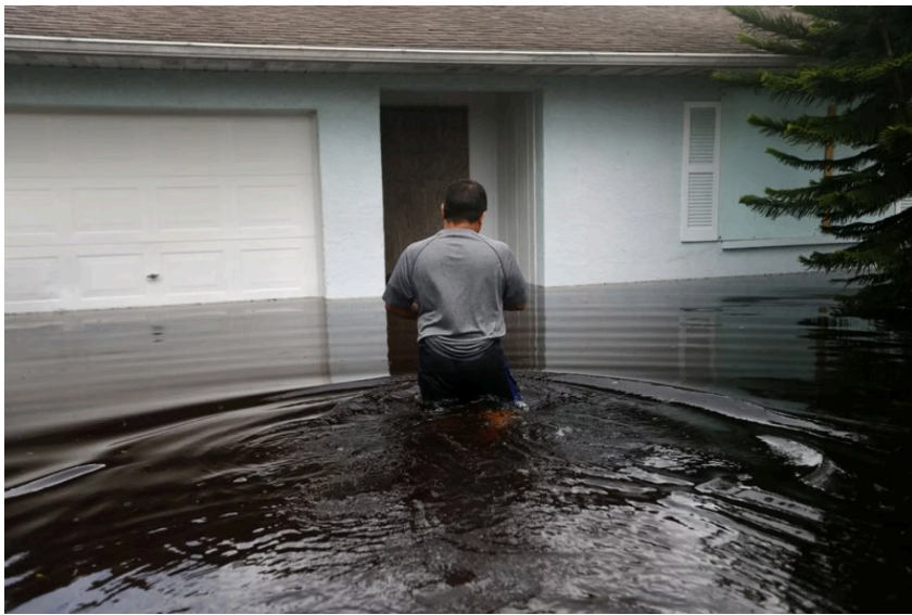
A man returns to his flooded home in the aftermath of Hurricane Irma in Bonita Springs, Fla., Monday, Sept. 11, 2017.