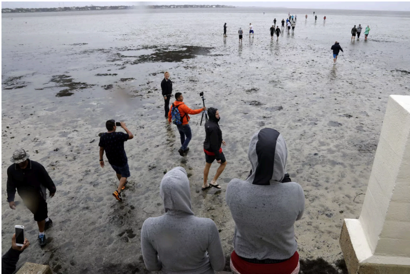
People walk out on what is normally four feet of water in Old Tampa Bay, Sunday, Sept. 10, 2017 in Tampa, Fla. Hurricane Irma and an unusual low tide pushed water out almost hundreds of yards.