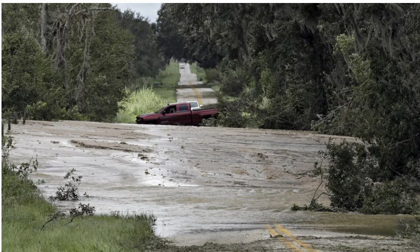
Motorists turn around after a levee from a phosphate plant ruptured from rain and wind associated with Hurricane Irma on Monday, Sept. 11, 2017, in Homeland, Fla.