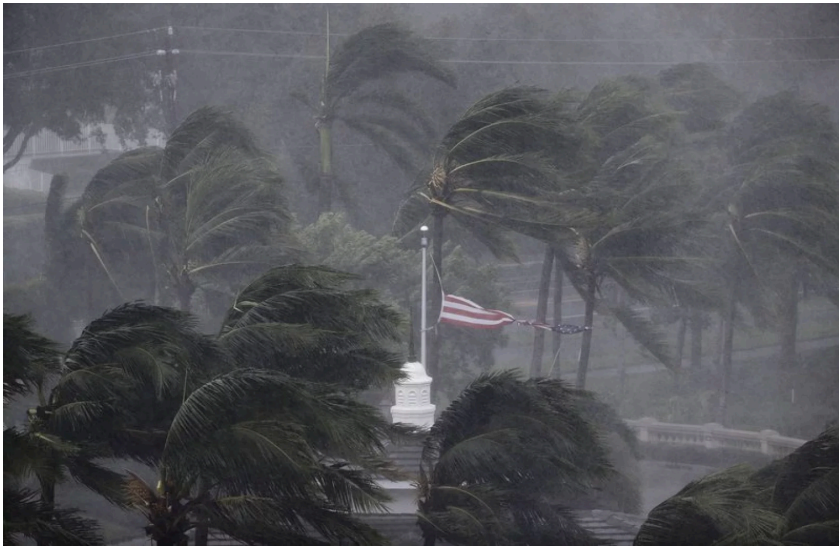
An American flag is torn as Hurricane Irma passes through Naples, Fla., Sunday, Sept. 10, 2017.