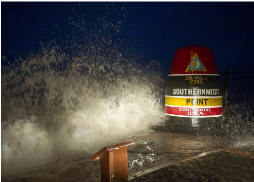
Waves crash against the Southernmost Point in Key West, Fla., Saturday, Sept. 9, 2017. Hurricane Irma's leading edge bent palm trees and spit rain as the storm swirled toward Florida on Saturday.