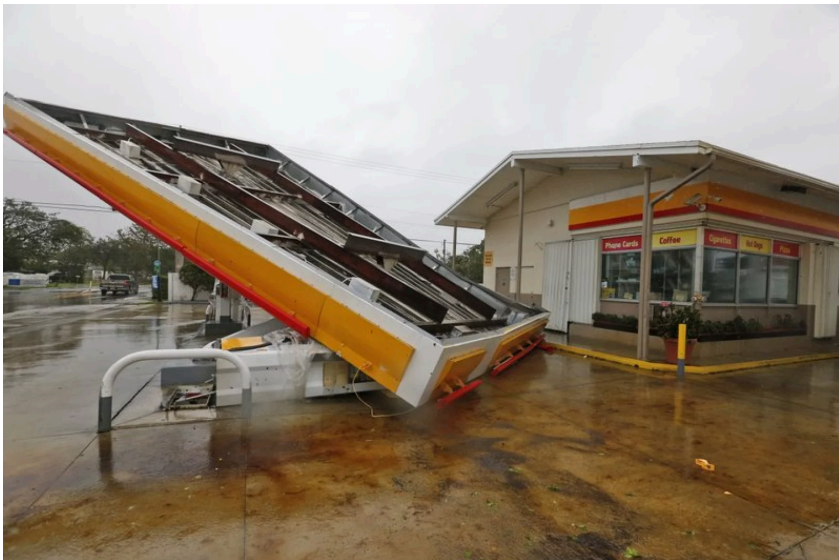
The metal canopy at a gasoline station is shown after it was overturned by high winds brought on by Hurricane Irma, Sunday, Sept. 10, 2017, in North Miami, Fla.