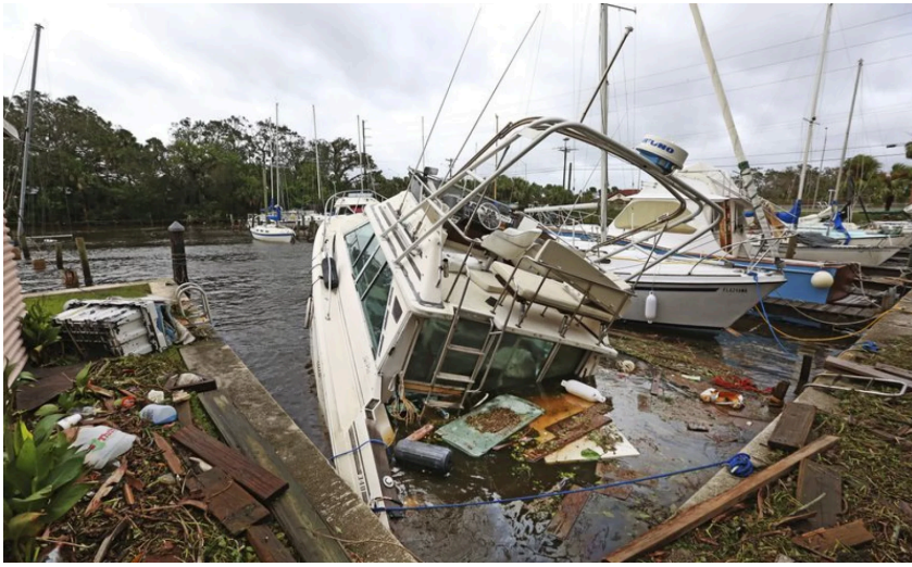
A sinking boat is surrounded by debris in the aftermath of Hurricane Irma at Sundance Marine in Palm Shores, Fla., Monday, Sept. 11, 2017