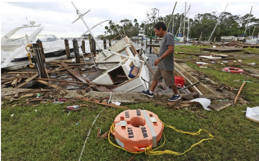
A man walks by damage from Hurricane Irma at Sundance Marine in Palm Shores, Fla., Monday, Sept. 11, 2017