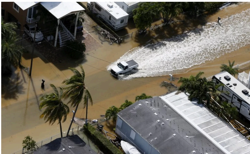
A truck drives through a flooded street in the aftermath of Hurricane Irma, Monday, Sept. 11, 2017, in Key Largo, Fla.