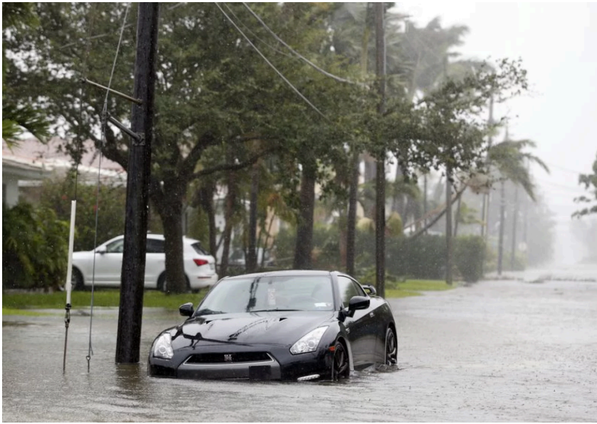
A car is parked on a flooded road as Hurricane Irma passes, Sunday, Sept. 10, 2017, in Surfside, Fla.