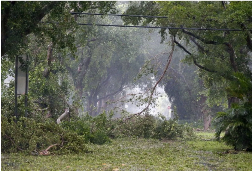
Debris fills the tree-lined streets of a residential area, Sunday, Sept. 10, 2017, in Coral Gables, Fla.