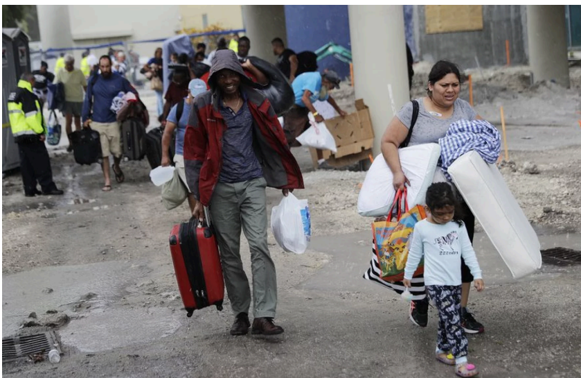
Evacuees are moved to another building with more bathrooms while sheltering at Florida International University ahead of