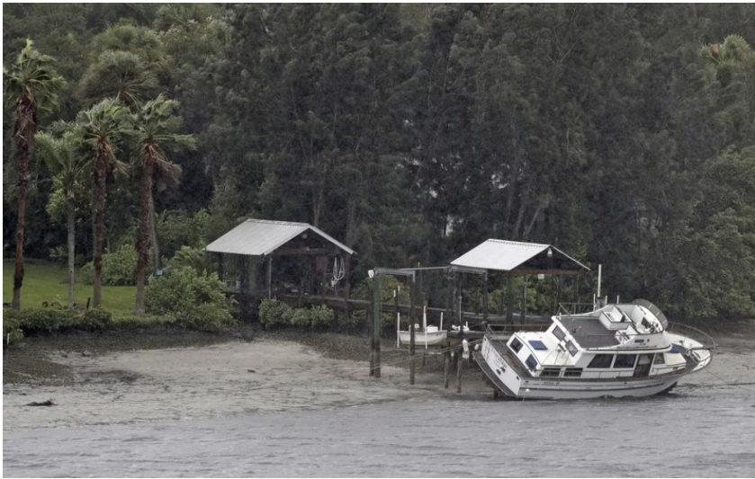
A boat rests on its side in what is normally six feet of water in Old Tampa Bay, Sunday, Sept. 10, 2017, in Tampa, Fla. Hurricane Irma, and an unusual low tide pushed water out into the Gulf of Mexico.