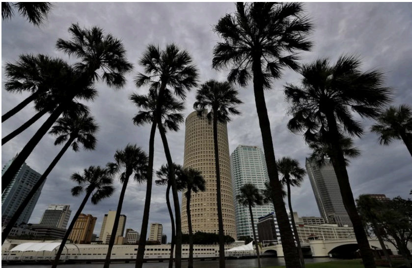
Storm clouds associated with the outer bands of Hurricane Irma shroud the downtown skyline Saturday, Sept. 9, 2017, in Tampa, Fla. Several parts of the Tampa Bay area are under a mandatory evacuation order for the approaching storm.

Hillsborough County Hurricane Irma then arrived in Hillsborough County weaker than initially expected, but still packing wind gusts of 100 mph.