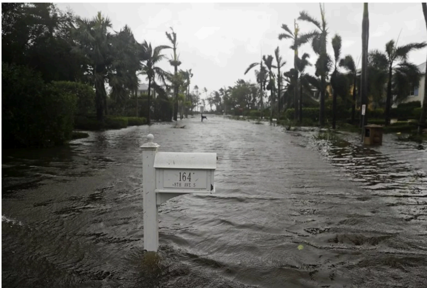
A street is flooded as Hurricane Irma passes through Naples, Fla., Sunday, Sept. 10, 2017.