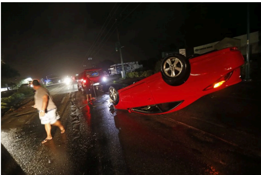
People tend to a car that flipped over on Cape Coral Parkway during Hurricane Irma, in Cape Coral, Fla., Sunday, Sept. 10, 2017.